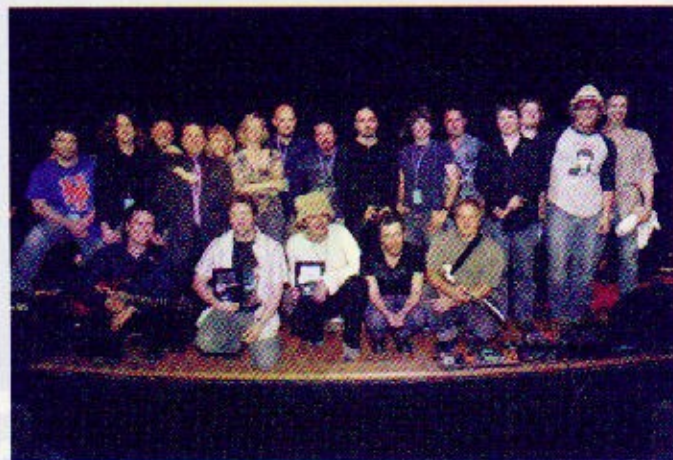
The Gang's All Here—Various contestants, house-band members, judges, and GP peoples take advantage of a photo op after the GH05 awards were announced.